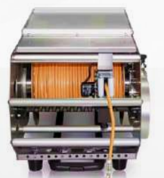
100 METER CABLE